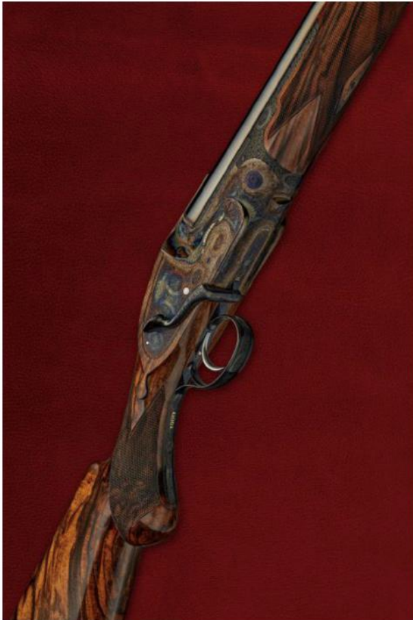
A new classic from Boss & Co.