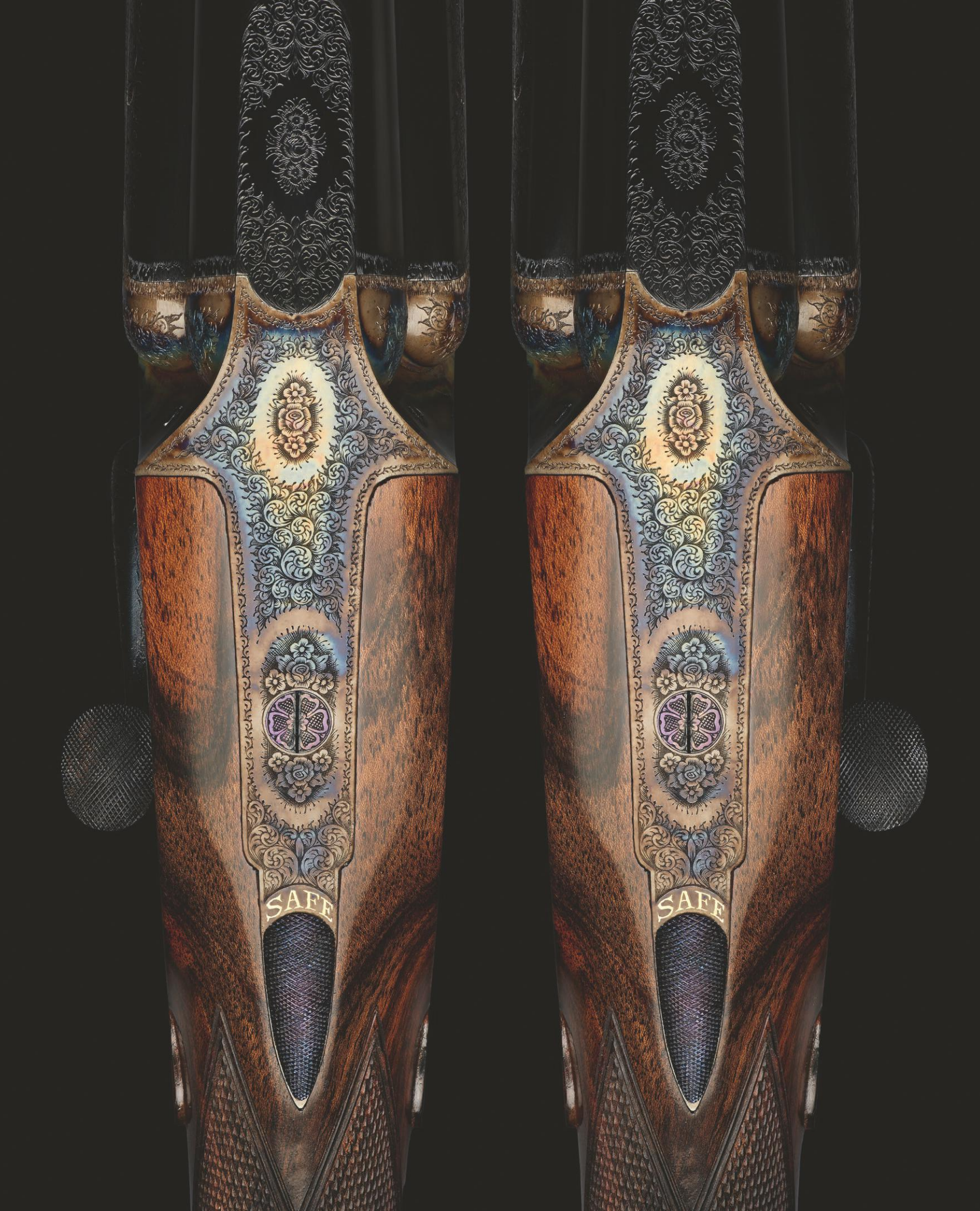
Image shows the same gun, first with the lever on the left of the action and then on the right of the action